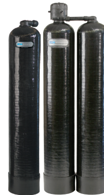
Kinetico CRS 1100 Chloramine Combination