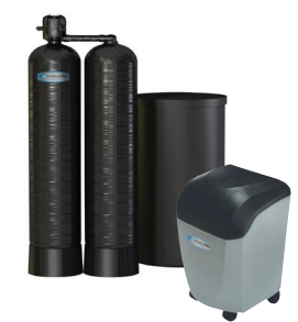
POE & POU Water Softeners

KineticoPRO™ offers a complete range of commercial water treatment solutions. Based on a per-location water analysis, we will work with you to prescribe the ideal water filtration, softening, and reverse osmosis solutions to optimize your water quality and protect your equipment.